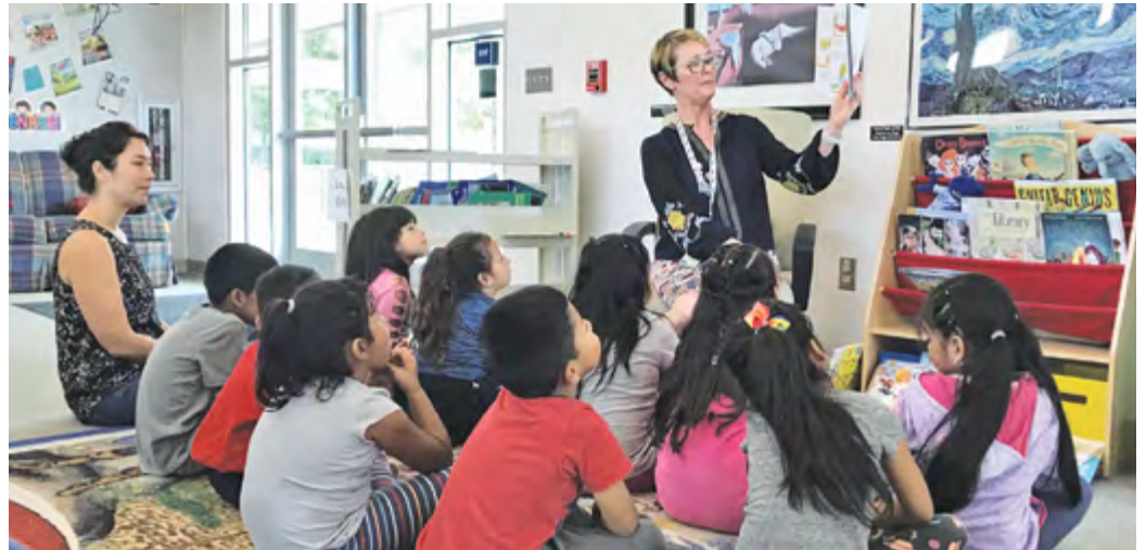
A group of primary newcomer students visiting the library.

The Newcomer program at Newhall Elementary has been designed to meet this student community's needs as they develop linguistic survival skills and start adapting to the new culture. Students meet four times a week with certificated teachers to develop beginning English language skills, acclimate to the school system, learn about classroom environment and learning, and build confidence.